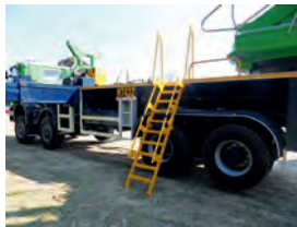
Mine specification fit out #