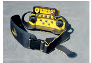
Independent radio remote control for flexibility in line of sight #