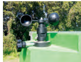
In-built anemometer assesses windspeed